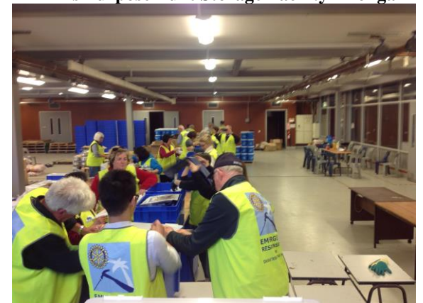
ERKs Packing Facility – Auckland