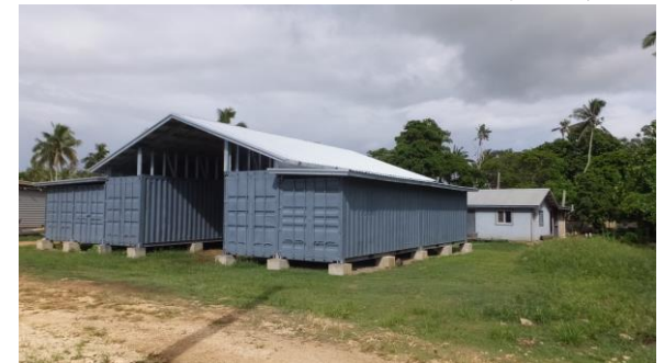
ERKs Purpose Built Storage Facility - Tonga