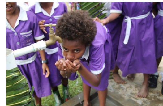
SDG 6: Ensure Access to Water and Sanitation for all.