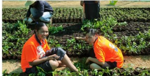
Seed Germination Producing Plants

Climate change is directly impacting Tonga’s food security, particularly after disasters. New climate resilient crops are needed to diversify the country’s food sources and adapt to the effects of climate change. Droughts and Tropical Cyclones are increasing in severity and frequency due to climate change, often resulting in crop decimation and significantly reduced food security, particularly in rural areas where access to affordable produce is limited and crop reliance is high. This Activity will work to address this, by creating a long-term supply chain and availability of climate resilient seed varieties, enabling farmers to grow foods that are adaptable to changing climate conditions. The Activity will also safeguard traditional crop varieties and improve agricultural biodiversity for future generations.