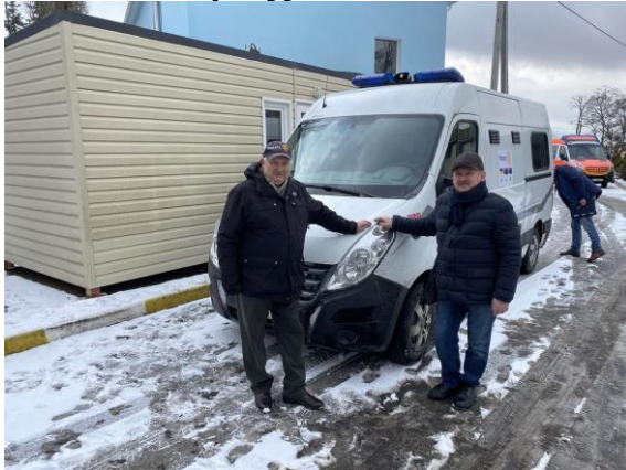
Ukraine Conflict – Housing and Ambulance etc.