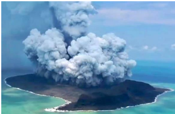
Tonga – Volcanic Eruption and Tsunami Community Support incl. for Disabled